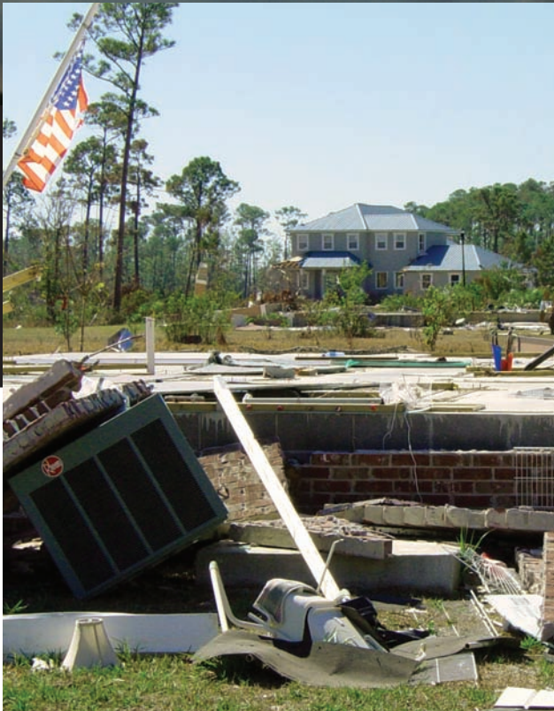
Every home in this neighborhood was destroyed by a category 5 hurricane, except the one built with ARXX ICFs.

Controlling the path of a tornado is NOT an option.