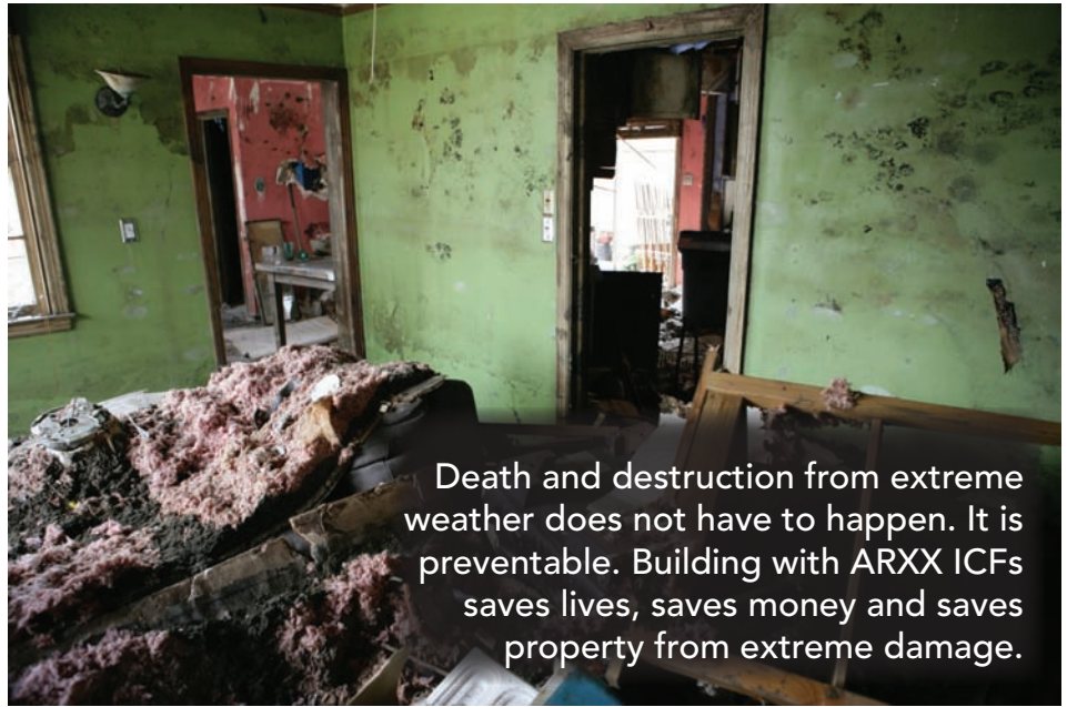
Timber frame home interior destroyed by water damage from Hurricane Katrina.

Heating and cooling can account for up to 70% of a home's energy costs. ARXX ICFs are highly energy-efficient and require 44% less energy to heat and 32% less energy to cool, on average. This means big savings and puts more money